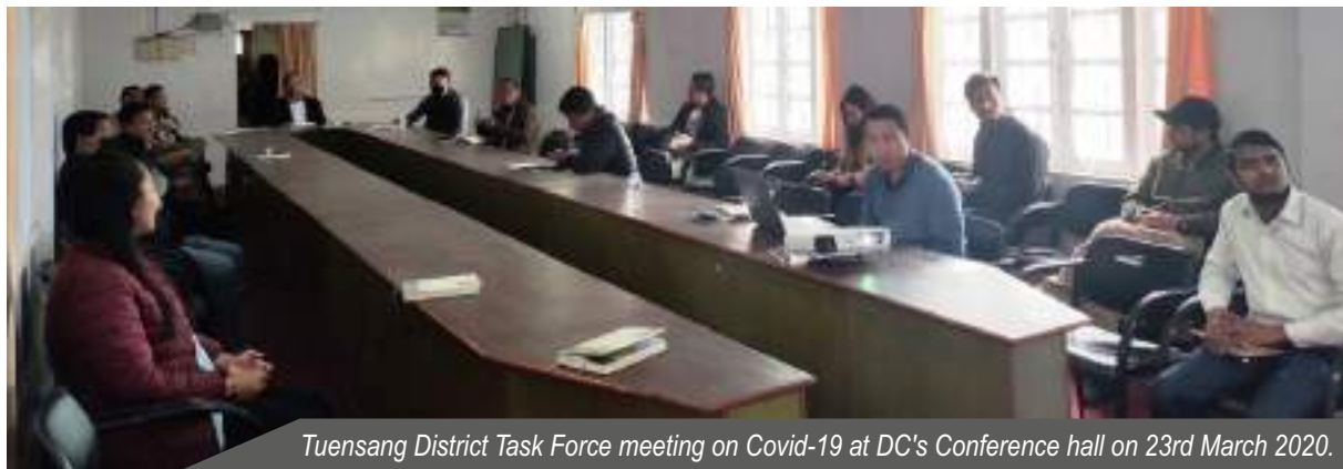
Tuensang District Task Force meeting on Covid-19 at DC's Conference hall on 23rd March 2020.

DC requested the house to spread awareness on unconfirmed/fake news/rumour mongering. All such messages should be confirmed from the authority concerned, he said and also requested the house to spread awareness on precautionary measures such as staying at home / washing hands / avoiding face touching / sneezing into tissues/elbow etc. He also stated that every flu, which is common in this season, should not be mistaken as COVID-19 related. However abundant precautions should be taken.