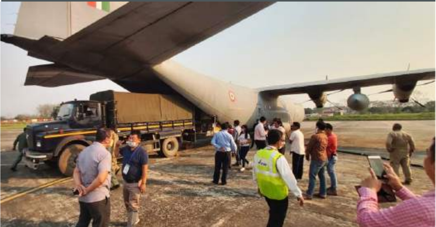
Indian Air force C-130 J loaded with Covid-19 medical equipments/hygiene aids arrives at Dimapur Airport on 30th March 2020 (Ababe Ezung)