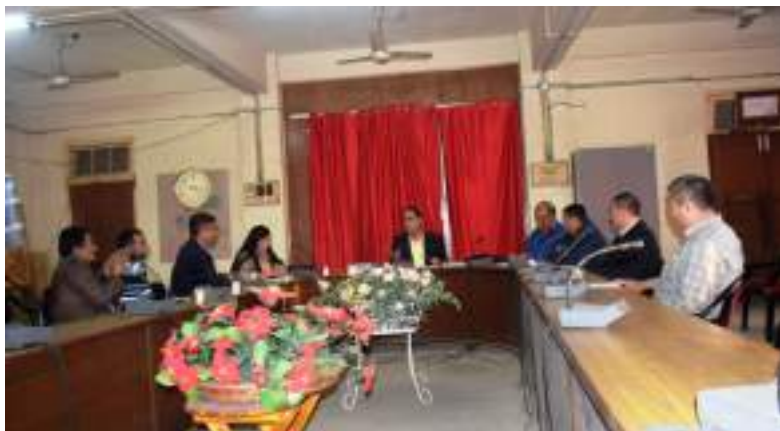
DC Dimapur, Anoop Khinchi, IAS holding a meeting on Covid-19 in the Conference Hall of DC Dimapur on 5th March 2020.

Commissioner Police, Dimapur, Rothihu Tetseo IPS, while stating that inconveniences may be felt by the commuters due to the ongoing road construction in Dimapur city however felt that one should have to obey National Highway Rules as recommended by the technical