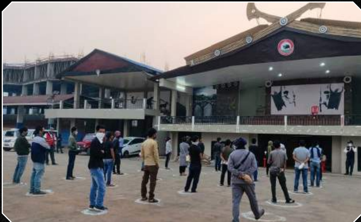
Kohima District Administration distributing relief ration to daily wage earners at relief Camp set up at Kohima Local Ground on 31st March 2020.