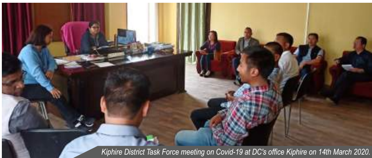
Kiphire District Task Force meeting on Covid-19 at DC's office Kiphire on 14th March 2020.

Kiphire District Task Force held a meeting for Covid -19 at the DPDB's Hall Kiphire on 20th March 2020. The meeting was attended by its members comprising of District Administration Kiphire, Medical department, church leaders, police, AR and Education department.