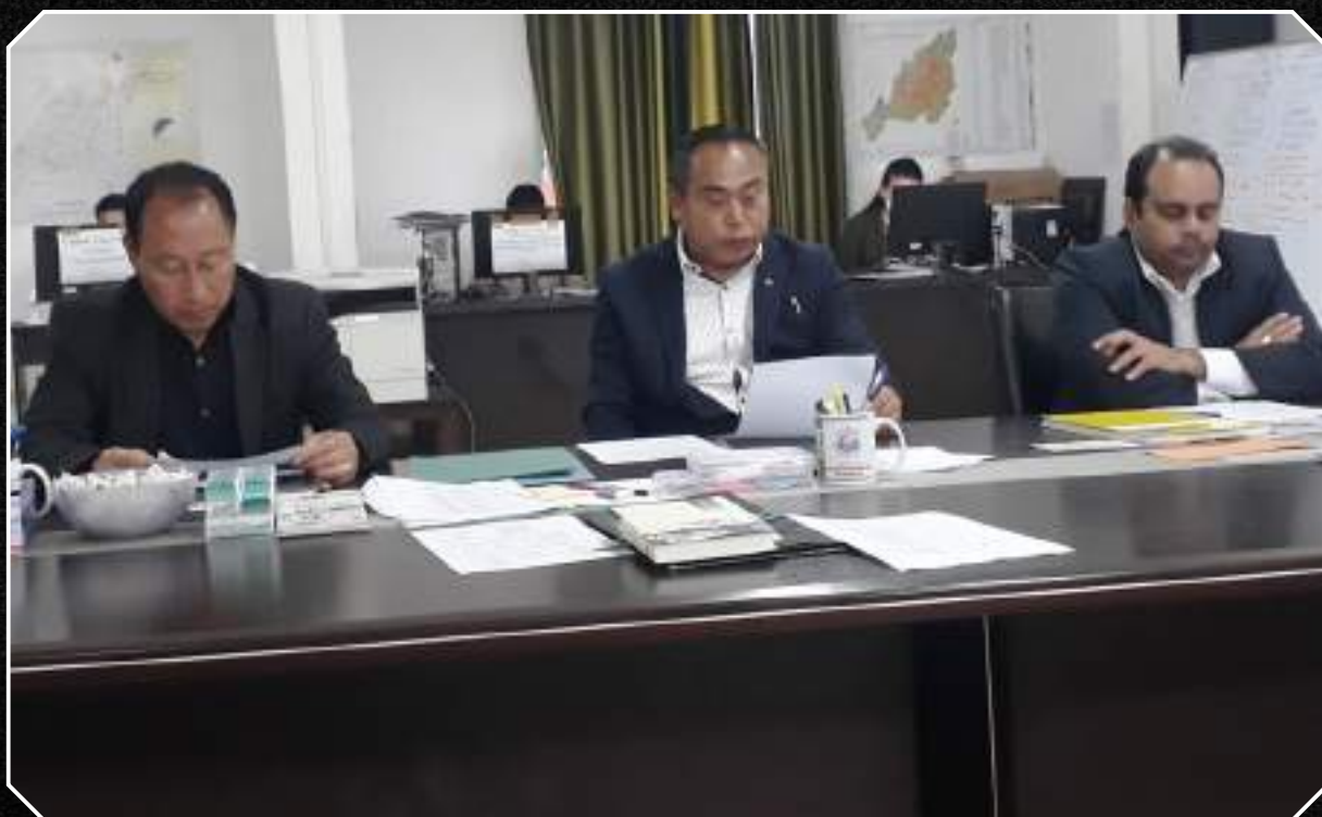
Minister Planning & Coordination and State Spokesperson for Covid-19, Neiba Kronu briefing on Covid-19 Status in Nagaland at NSDMA State Level Control Room Keziekie, Kohima on 27th March 2020.