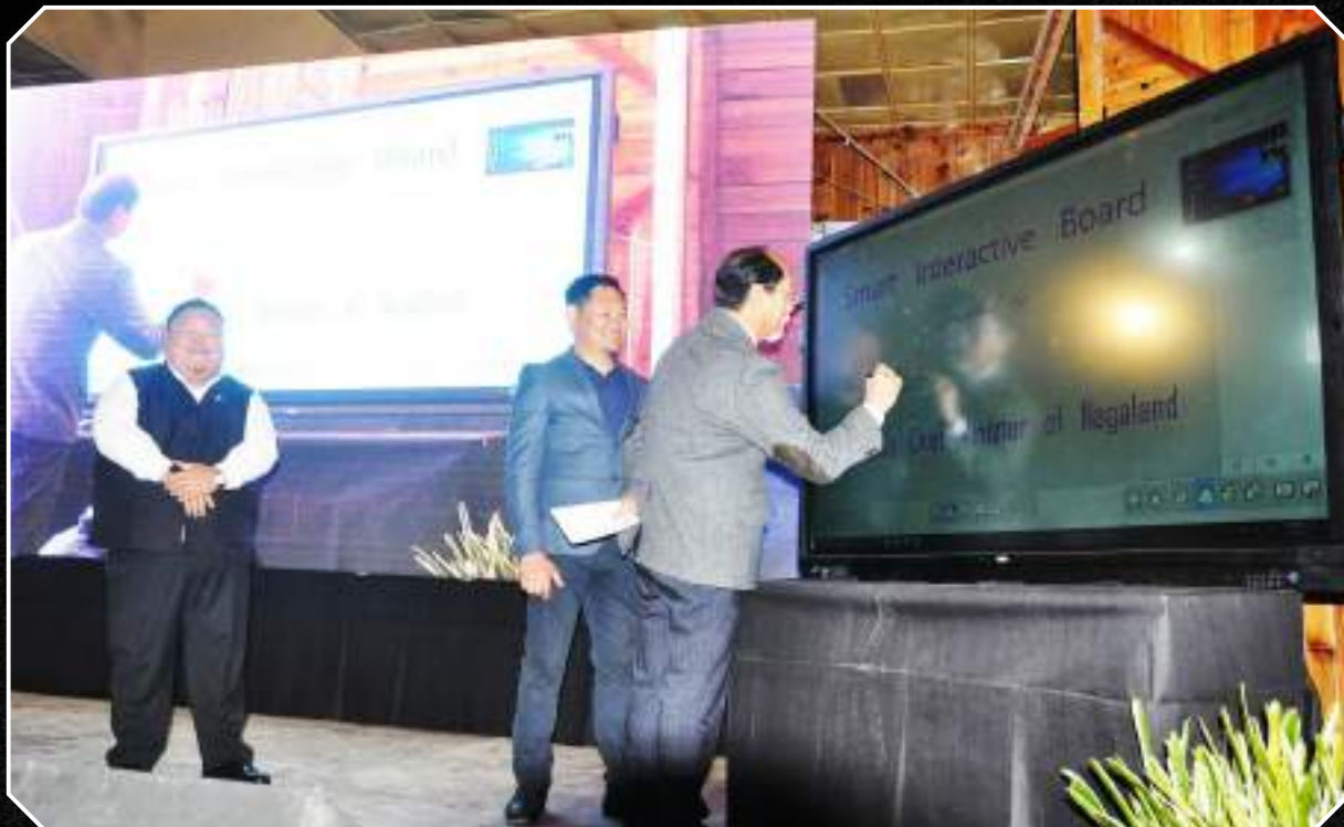
Chief Minister Nagaland, Neiphiu Rio launching the Interactive Digital Smart Board for Smart Classroom at Kohima Science College (Autonomous) Jotsoma on 4th March 2020.