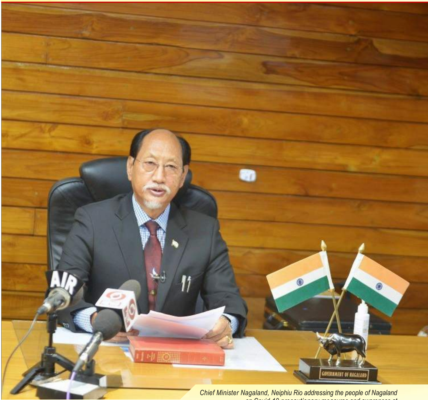
Chief Minister Nagaland, Neiphiu Rio addressing the people of Nagaland on Covid-19 precautionary measures and awareness at Chief Minister's Official Residence, Kohima on 23 rd March 2020.