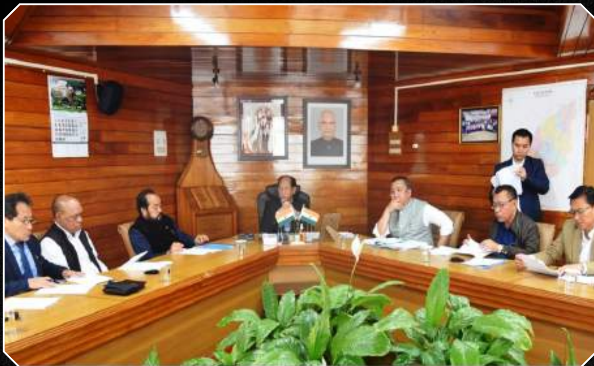
Chief Minister Nagaland, Neiphiu Rio convening a high level review meeting on Covid-19 at Chief Minister's Secretariat, Kohima on 16th March 2020.