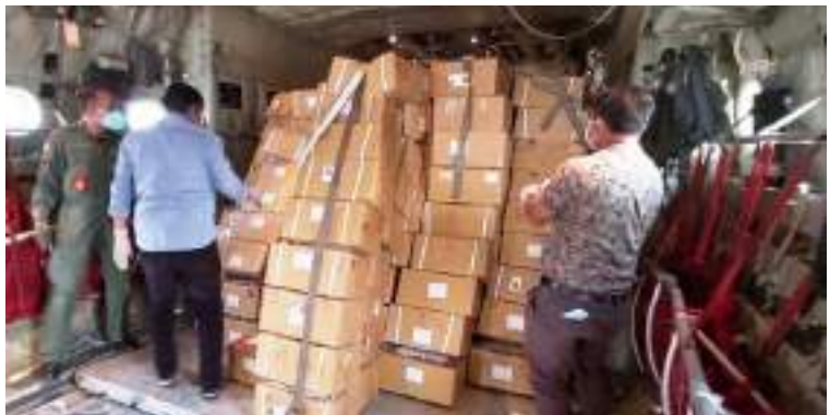
Indian Air Force C-130 J with Covid-19 medical equipments/hygiene aids landed at Dimapur Airport on 30th March 2020.

The airlift support operation was possible because of the close coordination by State Government officials, Dimapur based project office