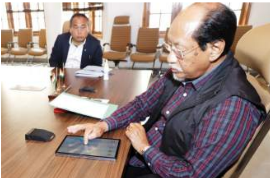
Chief Minister Nagaland, Neiphiu Rio launching the official app of the Department of Health & Family Welfare called the "SELF DECLARATION COVID-19" Nagaland app at his official residence on 28th March 2020.

SELF DECLARATION APP is compulsorily for any person who has entered the State of Nagaland after 6th March 2020. Students or travellers must register in the app immediately even if one had called the state / district helpline and registered earlier as non-compliance is a punishable offence under Epidemic disease act 1897.