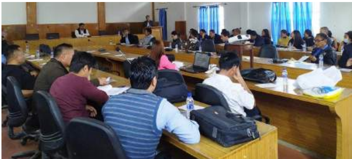
Demonstration on donning of Personal Protection Equipment (PPE) during Covid-19 training at DC's Conference hall, Wokha.

Training on Corona virus (COVID-19) was conducted by Health and Family Welfare department Wokha at Deputy Commissioner Conference hall on 18th March 2020.