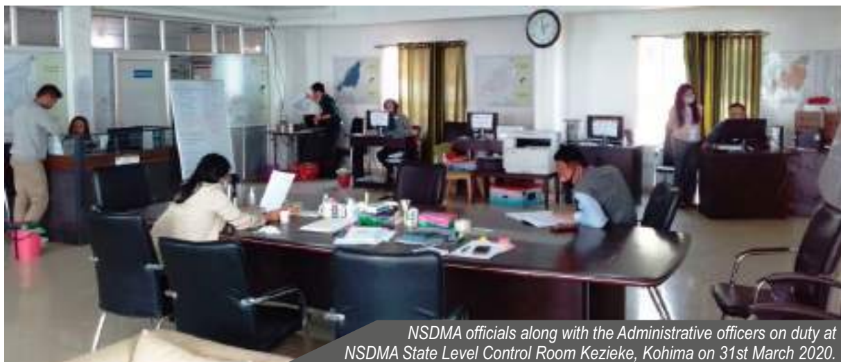
NSDMA officials along with the Administrative officers on duty at NSDMA State Level Control Room Kezieke, Kohima on 31st March 2020.

The Nagaland State Management Disaster Authority has set up a State Control room at Kohima since the State initiated the lock down to tackle COVID – 19. The NSDMA along with NCS officials, Home Guards and DIPR are at work to address the grievances of the public including the far flung areas of the districts and the State by promptly getting into action for any untoward incidents.