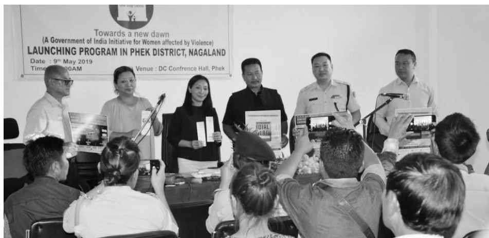
Officials launching the pamphlets and posters for SAKHI One Stop Centre Office at DC's Conference Hall, Phek on 9 th May 2019.