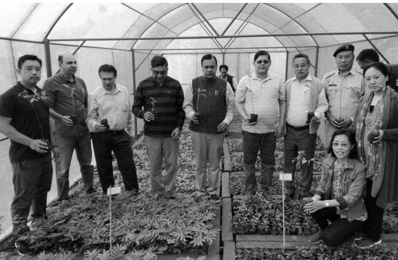
PCCF & HoFF, S.P. Tripathi with Department officials during the inauguration of first ever plastic free nursery at Kohima on 22 nd May 2019.

The first Plastic free forest nursery in Nagaland was inaugurated by PCCF & HoFF Nagaland, S.P. Tripathi in the presence of senior officials of the department on 22 nd May 2019 at Kohima. The nursery