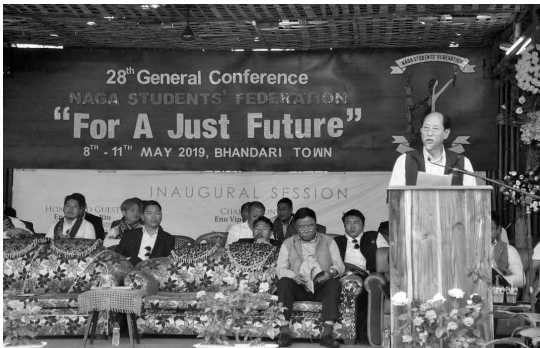
Chief Minister Nagaland, Neiphiu Rio addressing the inaugural session of the 28 th NSF General Conference at Bhandari, Wokha on 9 th May 2019.

He also said that the Nagaland Legislative Assembly unanimously passed resolution recognizing the sacrifices and sufferings of the Naga Nationalists and their families and said unity amongst all sections, over-ground and amongst the national organisations is the need of the hour. Nagas are at a crucial juncture in our history unless we live in peace and arrive at the political solution, our future may not be bright. We should not only support the peace process but we have to make sacrifices by rising above individualism,