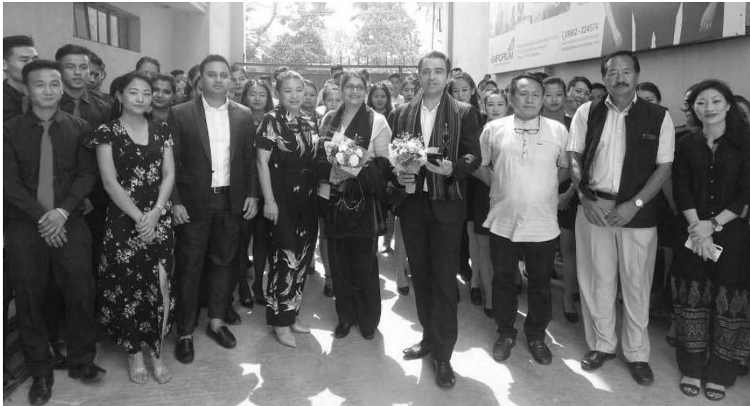
The Ritz- Carlton conducted a Campus interview at the Emporium Skill Training Institute, Dimapur on 9 th & 10 th May 2019.

Emporium will be hosting next campus interviews on 13 th & 14 th May 2019 for ITC Grand Bharat - Gurgaon and ITC Kohenur - Hyderabad.