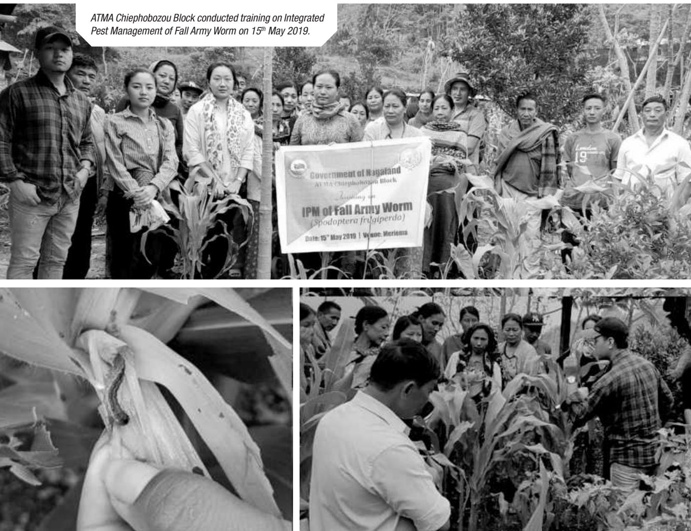
ATMA Chiephobozou Block conducted training on Integrated Pest Management of Fall Army Worm on 15 th May 2019.

left over stubbles as a preventive measure before the pest occurrence was emphasised. Importance of entomopathogens such as Beauveria bassiana , use of NSKE, marigold extract were also highlighted so as to reduce the environmental impact of insecticides. On severe infestation use of insecticide, namely, Emamectin Benzoate 5% SG under the trade name "Pocket" was recommended to spray over entire infested fields. Altogether 40 participants attended the training including other neighbouring villages.