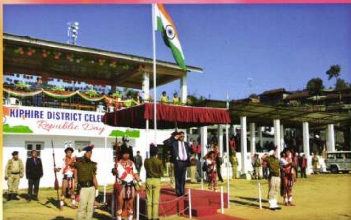
Minister for Power, C. Kipili Sangtam taking the salute the Republic Day celebrations at Kiphire.