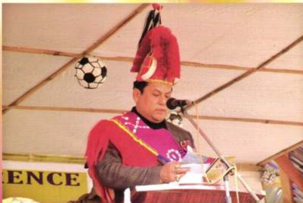
Minister of State for Youth Affairs and Sports, Govt. of India, Sarbananda Sonowal, speaking at the 31st triennial Conference cum Sports Meet at the LKM on 13th January 2016.