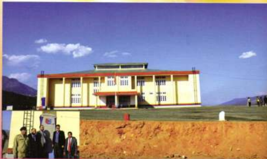
Minister of State for Home, Kiren Rijiju inaugurated the 14th NAP (IR) Battalion Headquarter and also unveiled the monolith on 25th January 2016 at Okhe Zong Kiphire.