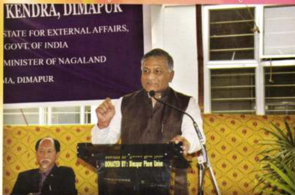
Minister for State for External Affairs, Gen. Dr. V. K. Singh speaking at the inaugural programme of PSK Dimapur on 15th Jan. 2016.