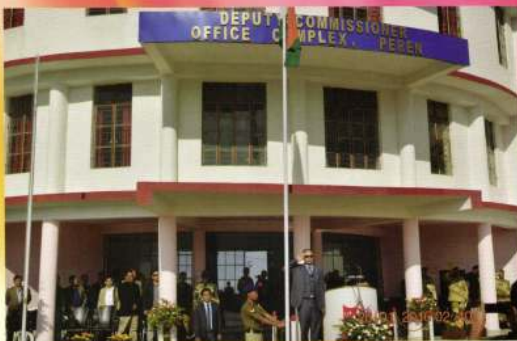
Minister for School Education and SCERT Yitachu taking salute during the Republic Day celebrations at Peren.