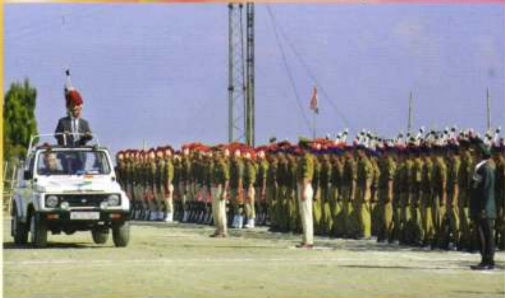
Minister for H&FW, P. Longon inspecting the parade contingents on Republic Day 2016 at Tuensang.