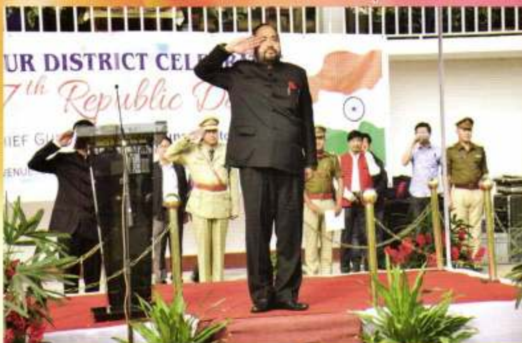
Home Minister, Y. Patton taking salute at the Republic Day 2016 at Dimapur.