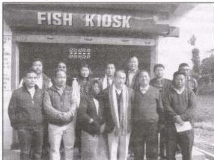
Director Fisheries, Officials and others at the inaugural of the fish kiosk at Jalukie on 29th Jan. 2016