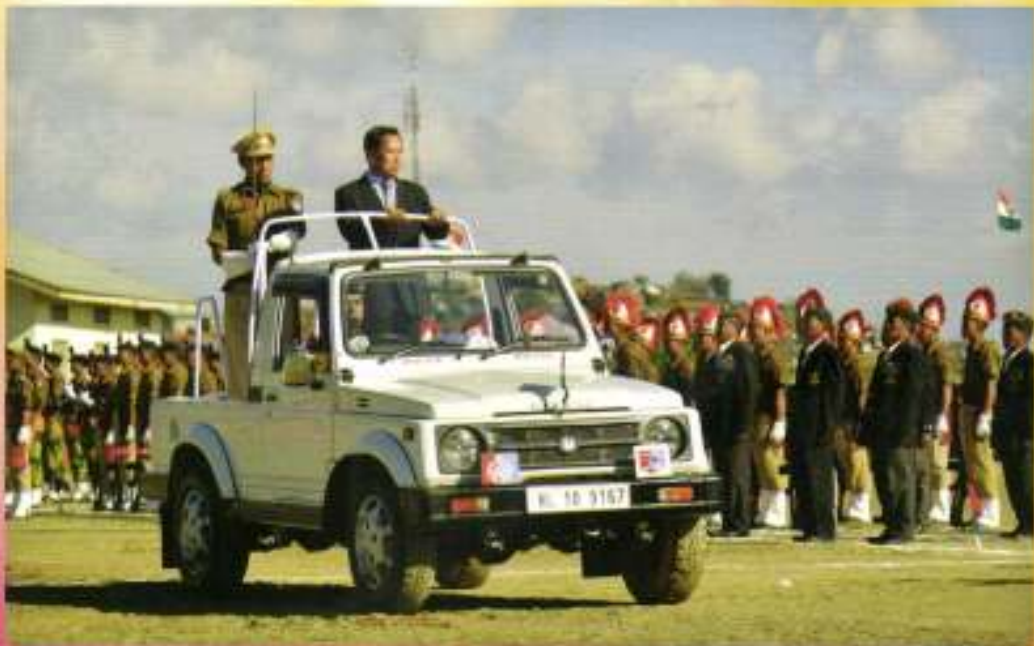
Minister for Roads & Bridges, Y. Vikheho Swu inspecting the parade contingents on Republic Day 2016 at Zunheboto,