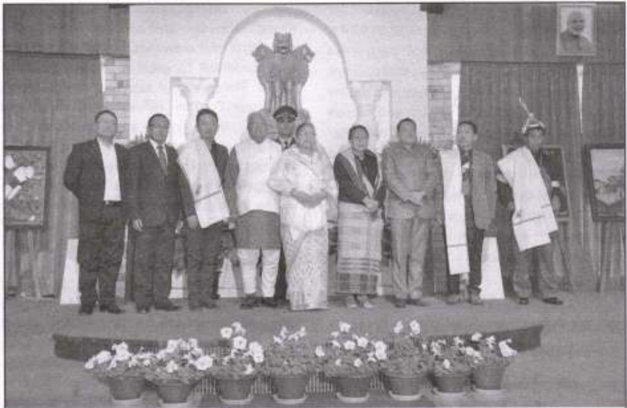
Governor of Nagaland, P.B. Acharya, C.M. of Nagaland, T.R. Zeliang and others dignitaries with the recipients of the Governor's Award 2015 at Raj Bhavan on 26th January 2016.

The exhibition cum sale was put up by the Departments of Agriculture, Cooperation, Environment, Forest and Climate Change, Nagaland Bee Keeping & Honey Mission, Nagaland Bamboo Development Agency, Soil & Water Conservation, Veterinary & Animal Husbandry, Fisheries, Sericulture, Nagaland State Disaster Management Authority, Territorial Army, Irrigation & Flood Control, Nagaland Empowerment of People through Energy Development (NEPeD), Nagaland State Legal Services Authority, Bio Resources Mission, Horticulture and the Department of Land Resources.