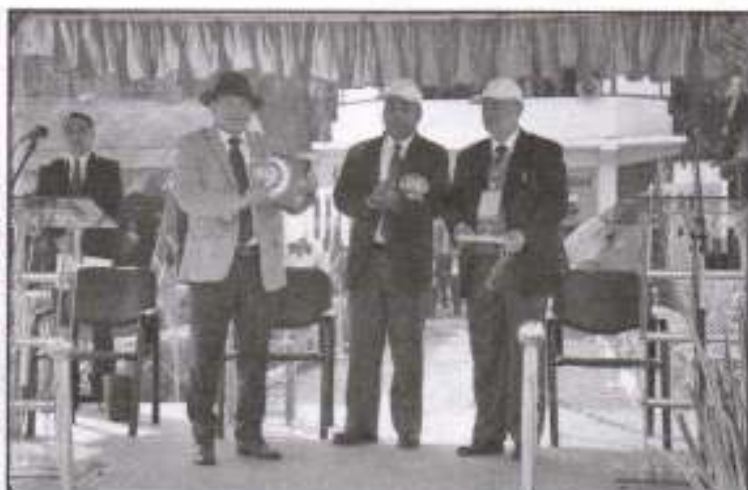
CM Nagaland releasing the souvenir of all India Archery Championship Nagaland at Chummukedima Dimapur on 19th January 2016.

Other highlights of the opening ceremony included introduction of participating teams managers, Band Salute, March pass by the teams, introductory remarks by organising Secretary, Welcome Speech by DGP Nagaland, release of souvenir by chief guest and oath taking by team captains. Altogether 21 teams with 287 participants consisting of 206 males and 81 females from different parts of the country participated in the championship.