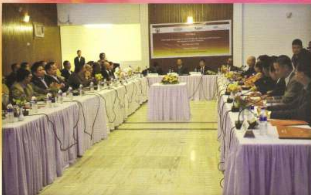
CM Nagaland TR Zeliang, Minister Economic Embassy of Japan, New Delhi Akio Isomata and others at the workshop on Indo-Japan partnership at Dimapur on 19th Jan. 2016