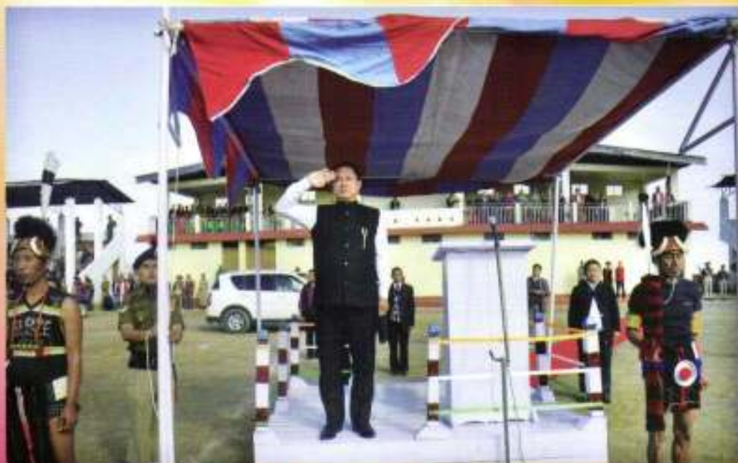
Minister for Mechanical, NH and Election, Nuklutoshi taking salute during the Republic Day 2016 celebration at Longleng.